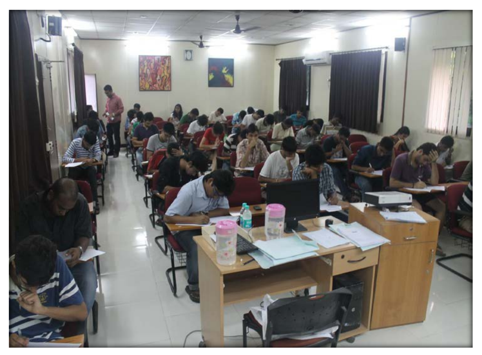
Jigyasa Quiz conducted in UM-DAE CBS