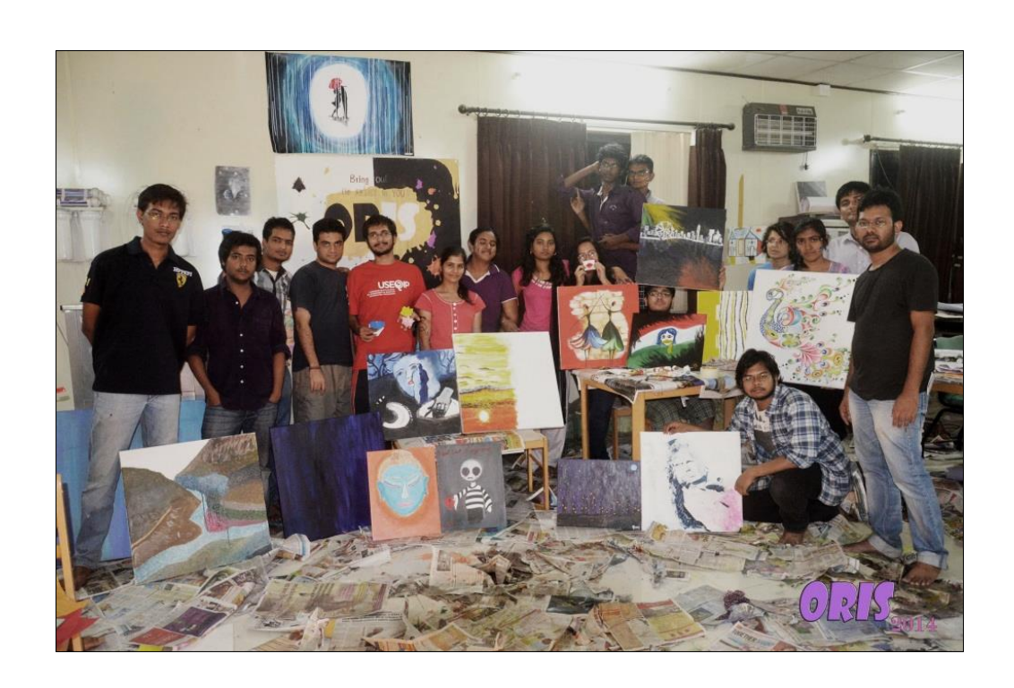
ORIS Art Festival held on March 15-16, 2014