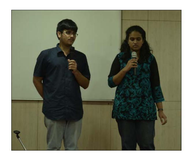
Musical Event on CEBS Foundation Day held on September 23, 2013