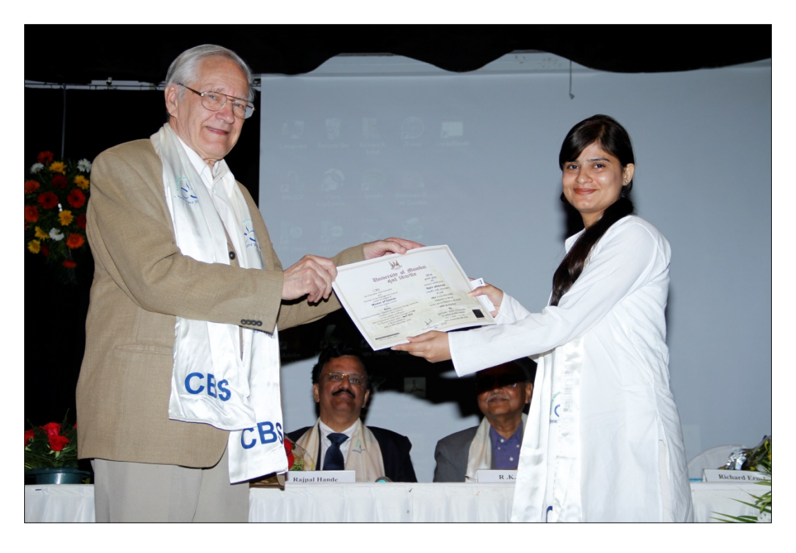
CEBS first Graduation Ceremony held on April 22, 2013