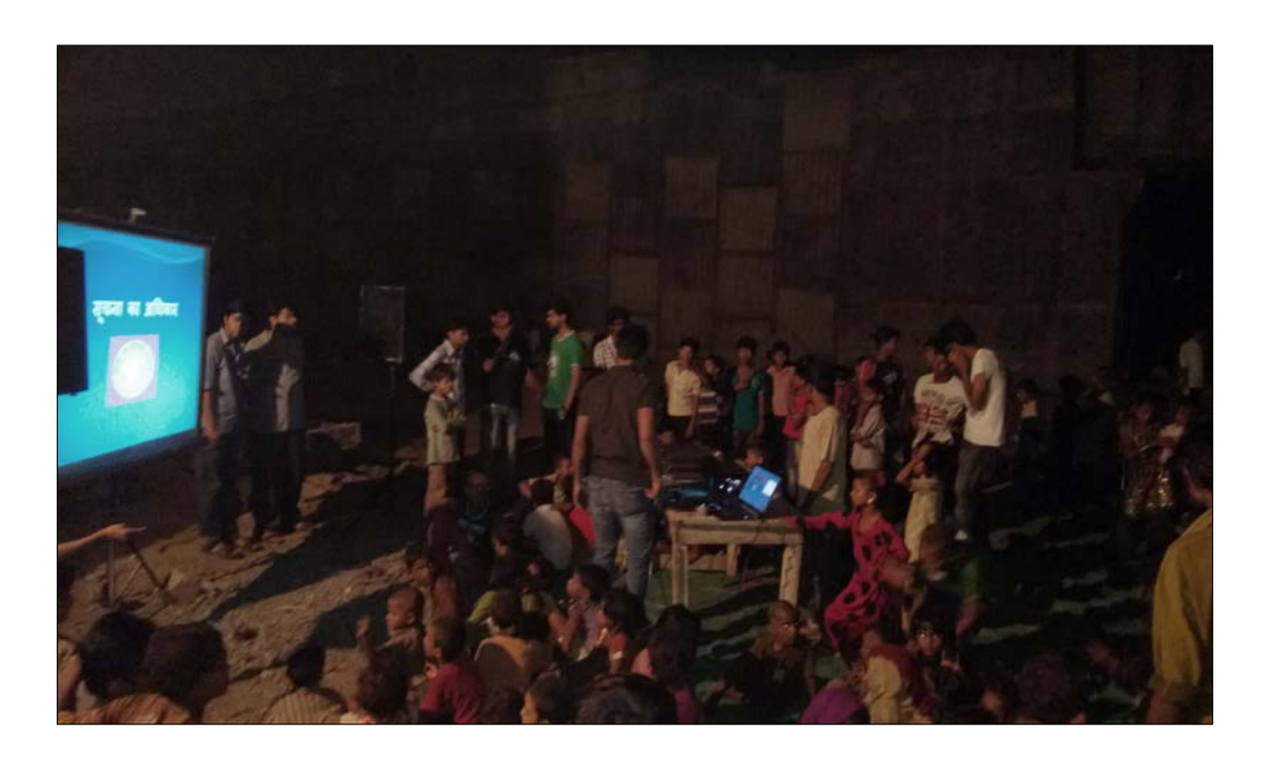
Social upliftment programme: CEBS students giving audio visual presentation to laborers' children