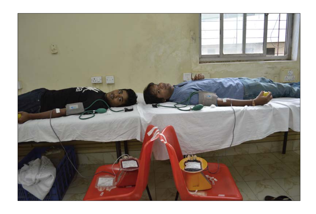
CEBS first blood donation camp held on August 27, 2013