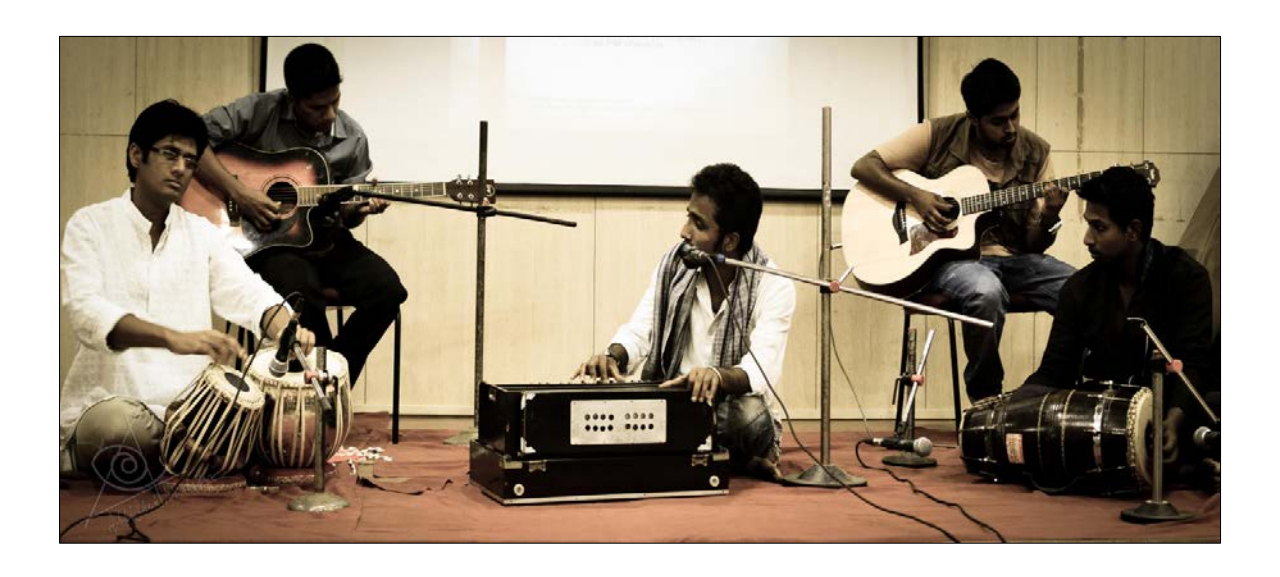
Dhwani Programme held on April 17, 2014