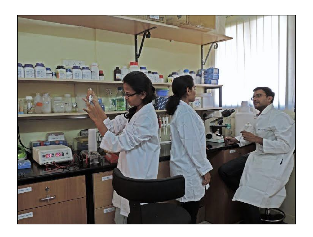
Laboratory of Epigenetics - of behaviour and diseases